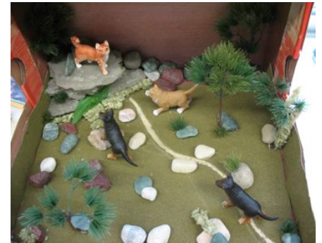
Photographed: Top: Scene from "The Seekers", book 3 Created by Kate Mertus Bottom: Scene from "Warriors" Created by Dominic Hauptman