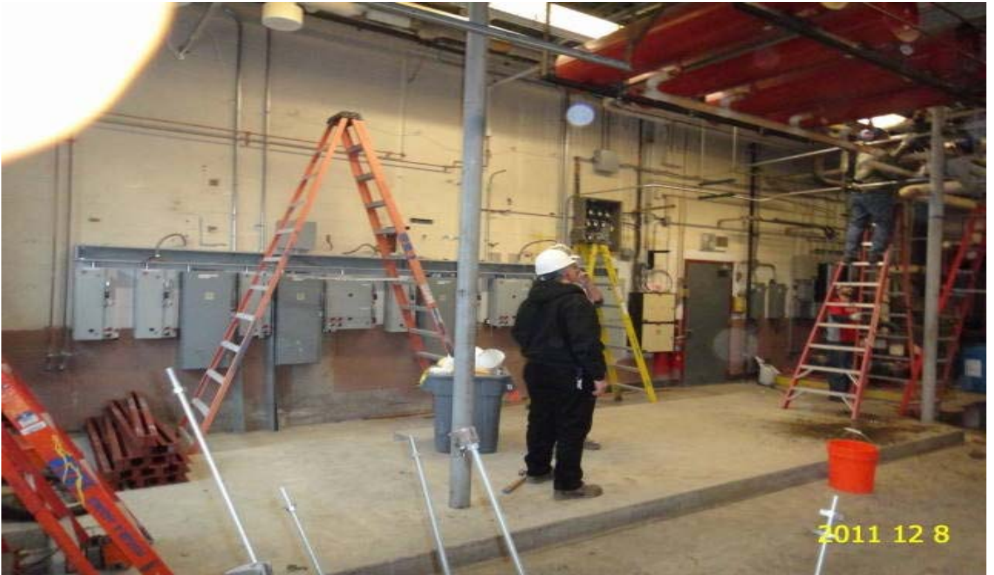
EHBR-6: East High Boiler Room