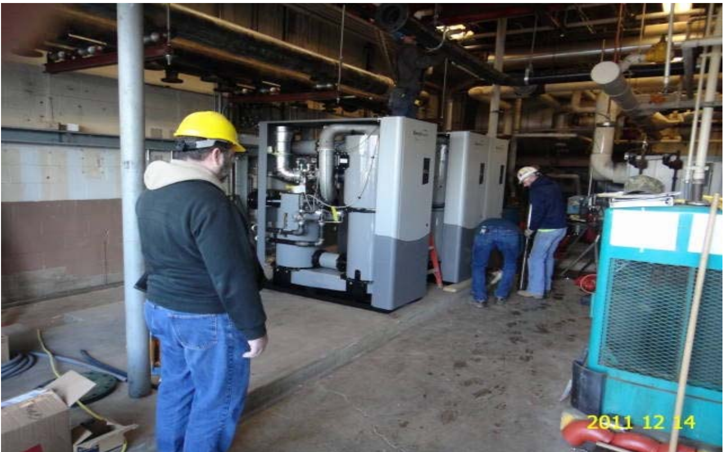
EHBR-7: East High Boiler Room