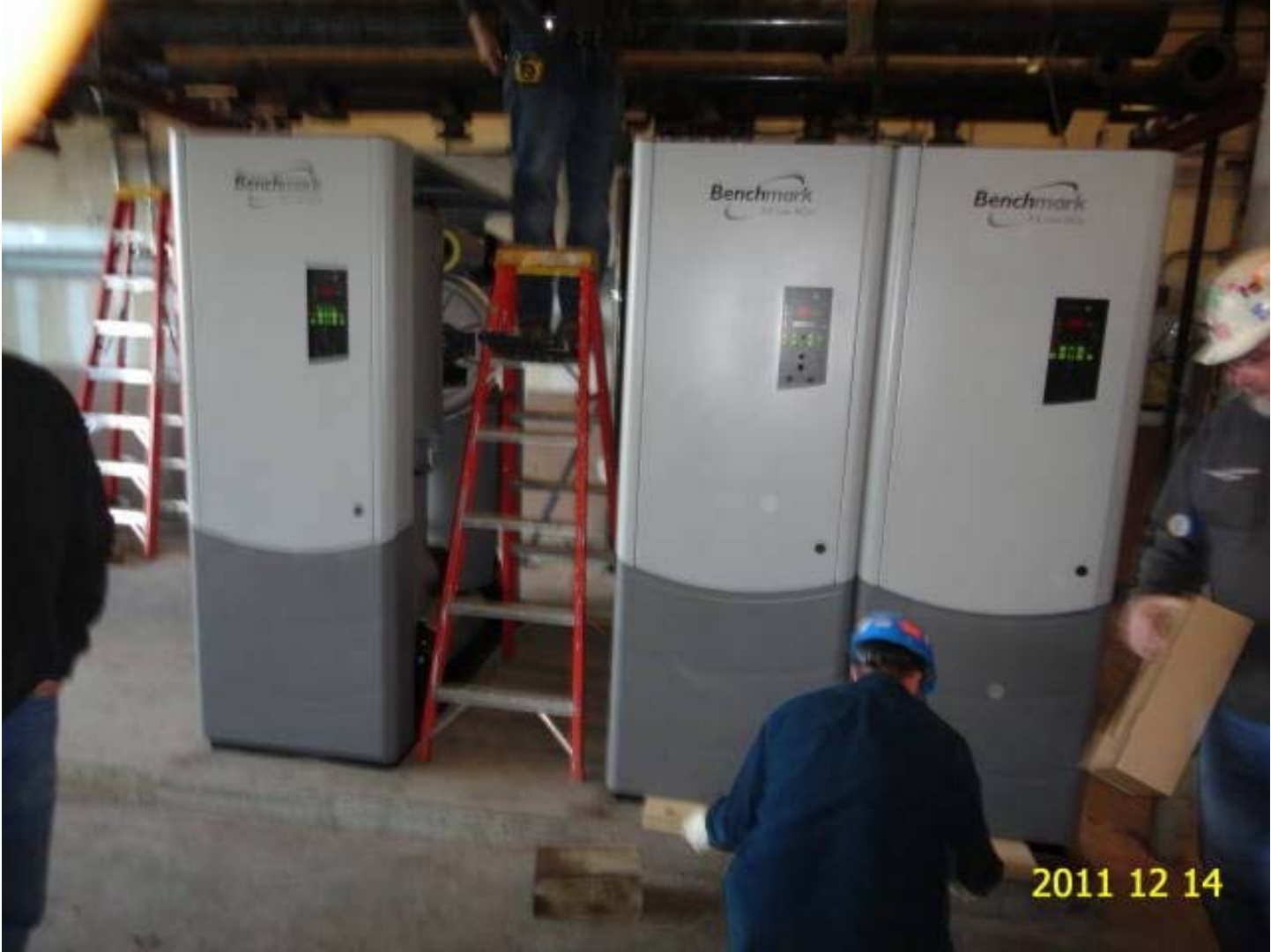
EHBR-8: East High Boiler Room